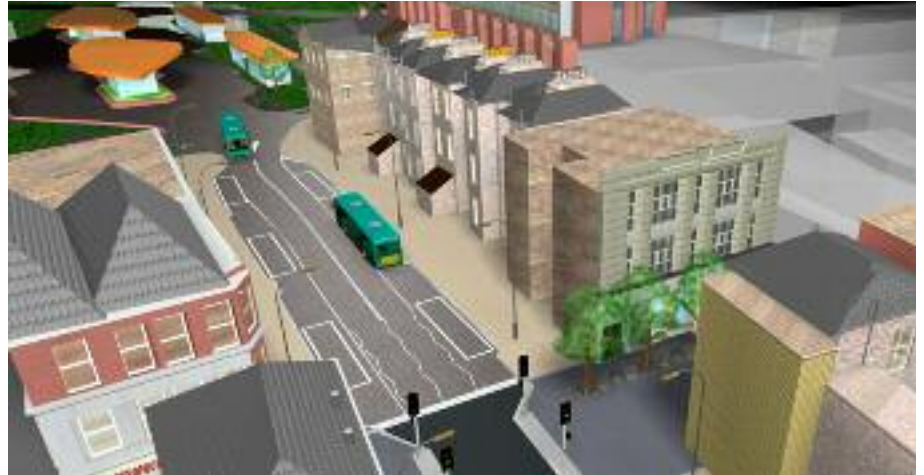
■ Impression of how central Chatham will look

Work has now begun on major road improvements that will give Chatham improved traffic flow for years to come.